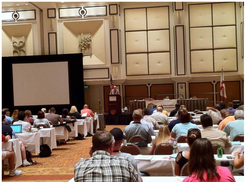
“Hot Topics in the Legal Arena”