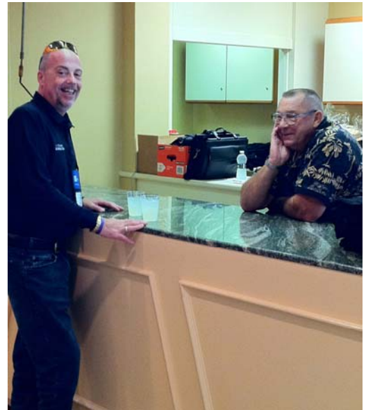
Catching up during a Session Break